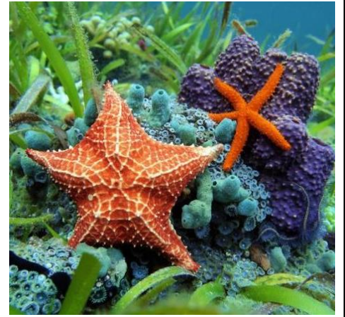
ETOILES DE MER